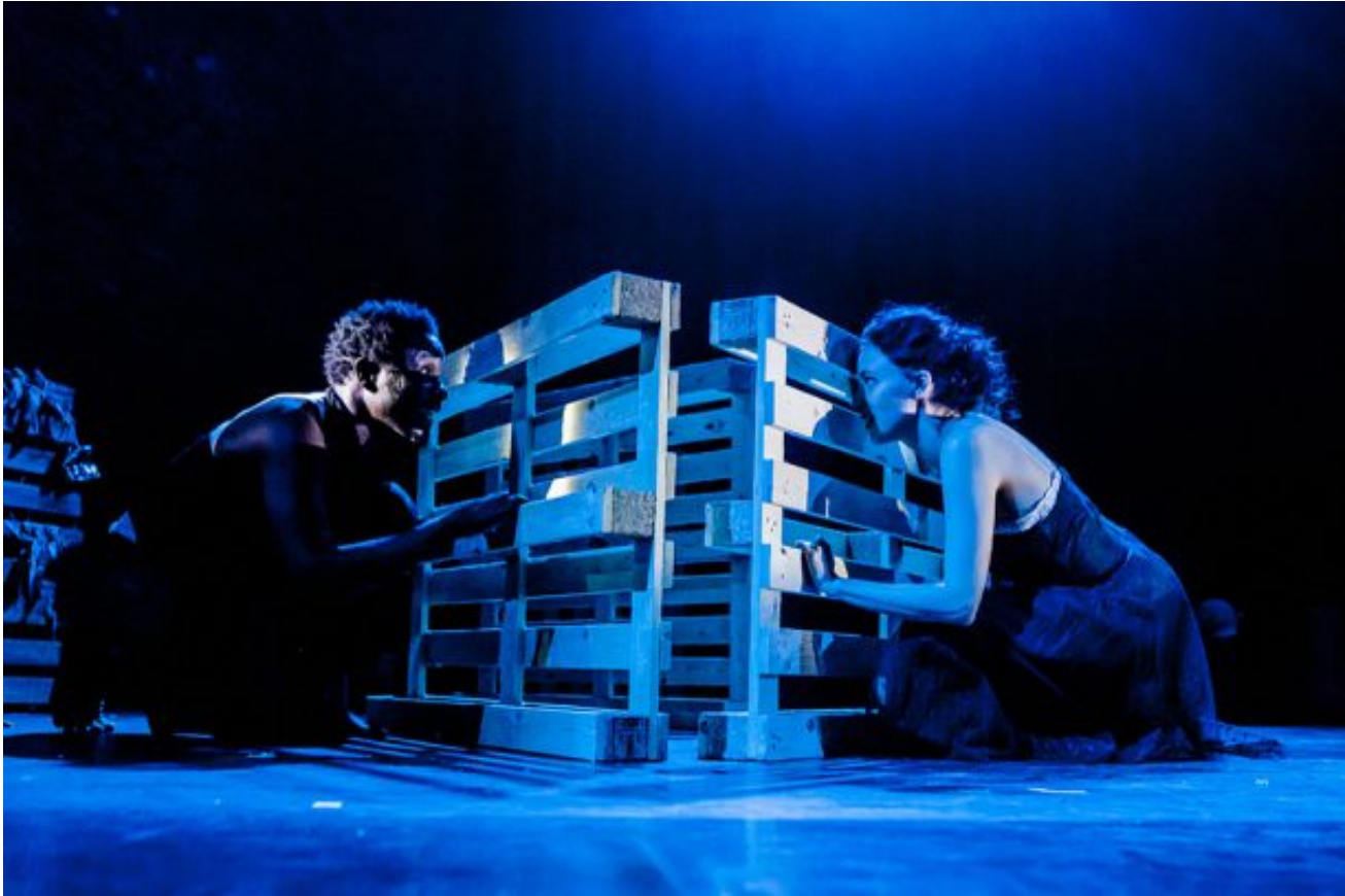
Romeo et Juliette.

The Festival this year devoted special attention to Shakespeare, with a two-day academic conference concerning his influence in the Arab world, and with a number of the performances associated with him. Although I wanted to concentrate on Arab theatre, it seemed appropriate that I continue my festival-going with one of the more ambitious festival works, a Romeo and Juliet which was a joint production of Belgium, Burkina Faso, Benin and Guyana. This took place at the Mondial, an elegant small theatre in central Tunis that has been, since Independence, one of the city's major performance spaces.