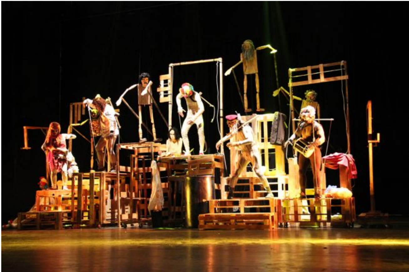
Metamorphoses.