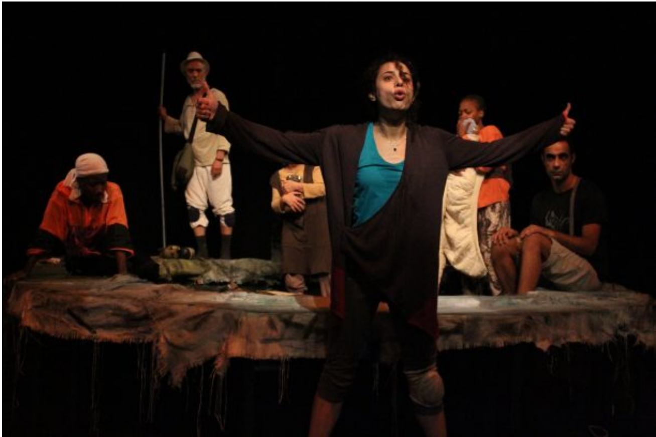
Le Radeau . Photo: El Hamra

The Festival opened, fittingly, with a production from the Tunisian National Theatre, the theme of which could not have been more timely or appropriate. The production was Le Radeau (The Raft), conceived by Cyrine Gannoun and Majdi Abou Mataren. The minimalist setting in fact represented a large inflatable raft, the floor of which was a trampoline so that the eight actors in the ramp were in constant up and down motion, suggesting their sea passage. The international cast, including Syrians, Lebanese, Tunisians, and fellow Africans joined together in the all-too-familiar mutual upheaval of fleeing violence at home in search of an uncertain future across the sea. Their negotiations of interpersonal conflicts and dedication to a common goal resonated strongly with the overflow audience, which interrupted the production with frequent applause, not for a particularly theatrical moment, but for some stirring sentiment. The topicality of this well-performed piece and its use of performers from a variety of Arab and African theatre cultures made it a particularly apt opening selection.