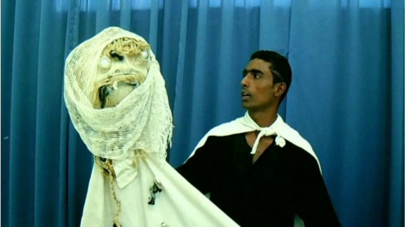
L'Ogre et les sept pucelles . Tunisian National Marionette Theatre

production, at least half of the audience left, but there was little reward for those who stayed, as the same lack of focus and direction continued. To be fair, there were clearly major technical problems, especially with the lighting, but that could hardly excuse the unfocused acting, nor the long moments when the stage stood inexplicably empty.